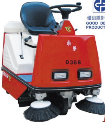
Type D-36B (Battery operate)