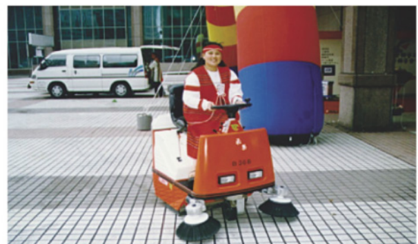
Sweeping in square.