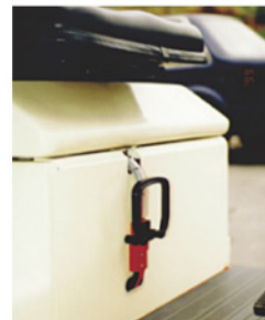
Emergency stop switch by disconnect the battery connector.