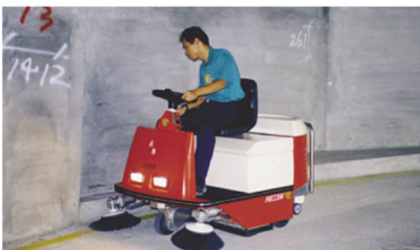
Sweeping in side way.