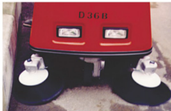
Corner can be easy to sweep. Side brush protection.