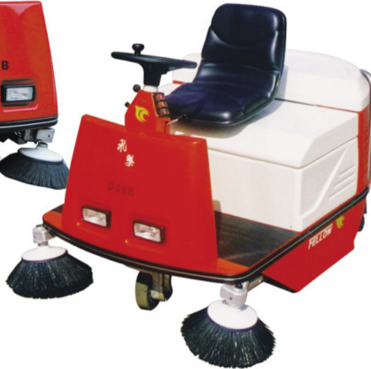
Type D-48B (Battery operate)