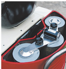
Remove dust by electric shaker. Saving time and labor costs.