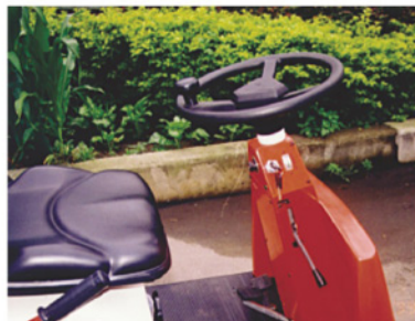
Power steering. Easy to operate.