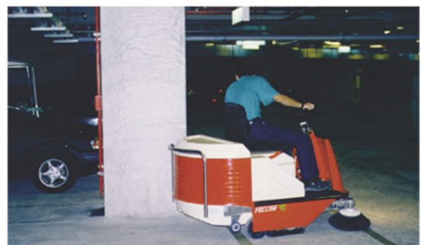
The D-48B efficiently cleans large indoor areas with ease perfect for parking lot and distribution centers.

PROFESSIONAL MANUFACTURER FELLOW Y.C. CO., LTD. http://www.fellowyc.com.tw E-mail: yc@fellowyc.com.tw