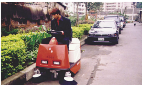
Sweeping in street.

In the interest of technical development we reserve the right to alter equipment without prior notice.