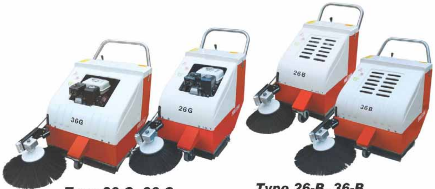
Type 26-G, 36-G (Petrol engine)